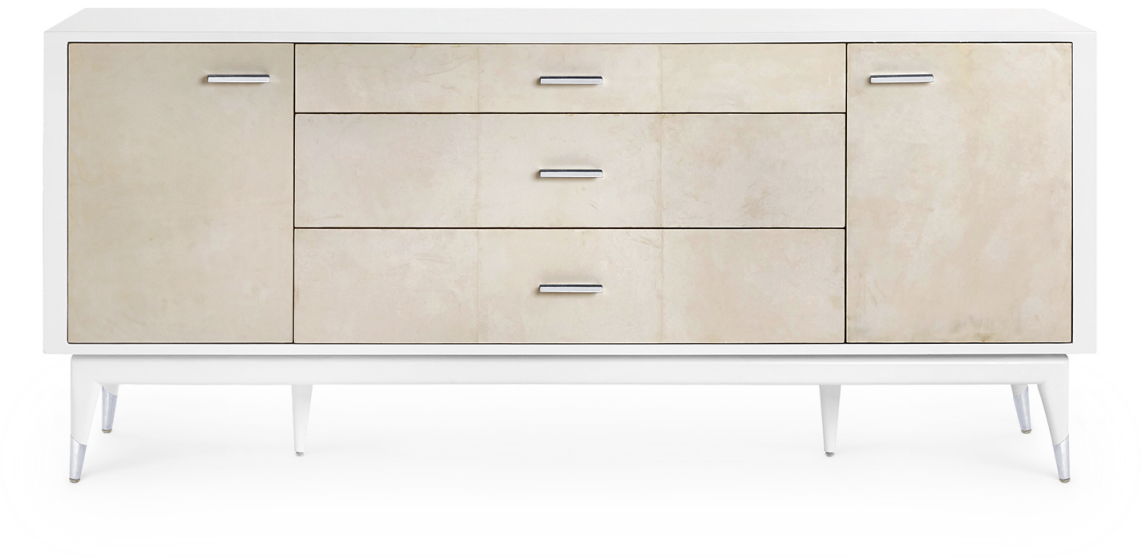
TOMMI 3-DRAWER & 2-DOOR CABINET, WHITE