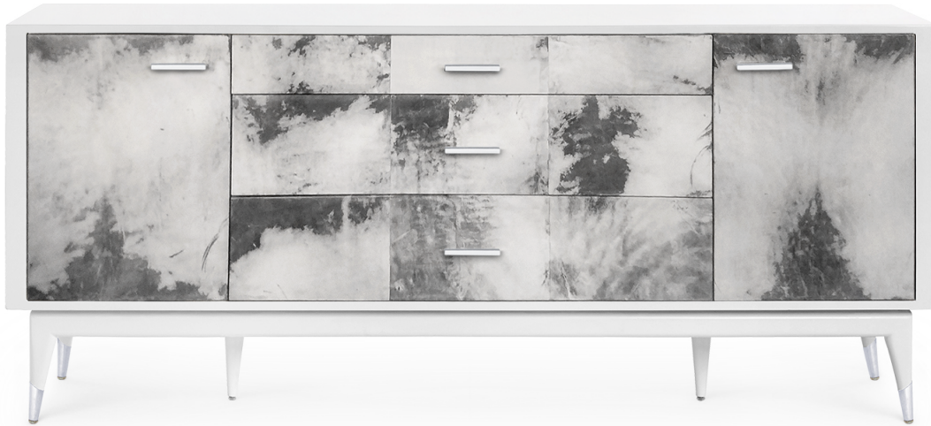
TOMMI 3-DRAWER & 2-DOOR CABINET, GRAY