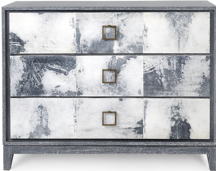
PHILLIPS LARGE 3-DRAWER, GRAY